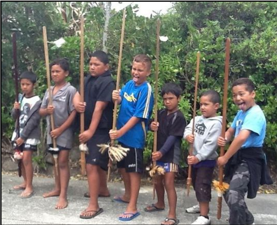
TAKU TAIHAHA: Students studying the Māori martial art, mau taiaha, January, 2013.

One hundred years of mau taiaha wāngana on Matiu Somes Island is our aim, said wāngana organisers.